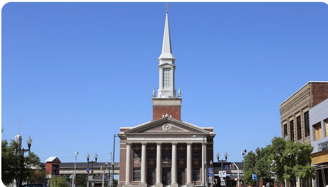
First Methodist Church, Shreveport, Louisiana