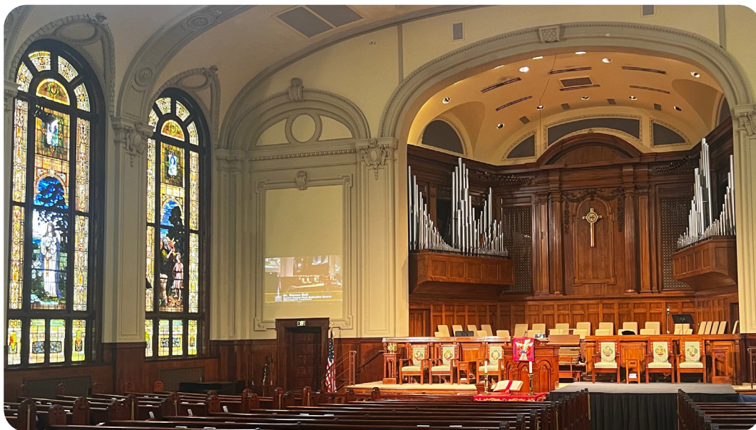
First Methodist Church, Shreveport, Louisiana